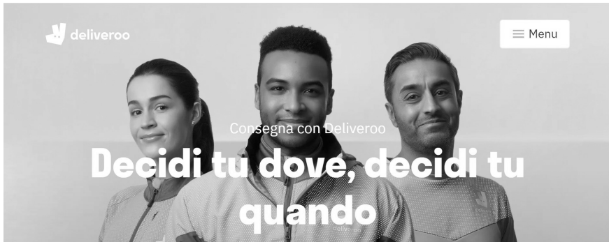
FIG. 1. Deliveroo website banner.