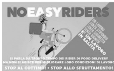
FIG. 2. No Easy Riders flyer.