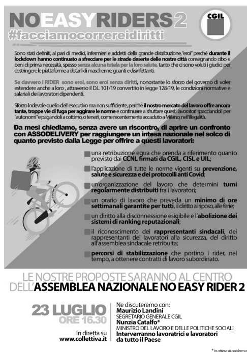
FIG. 3. No Easy Riders 2 flyer.